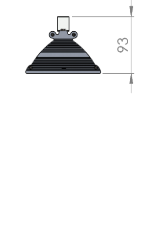
Solar LED Power Ltd. is constantly developing and improving its products. The right is reserved to change specifications without prior notification.